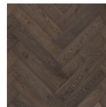
Segno Oak Old Brown

The pictures only present the colour of the floor. For more details regarding grading and variations see the Grading Book or www.tarkett.com .