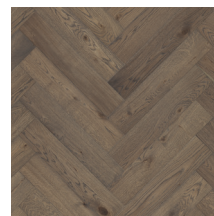
Segno Oak Old Grey