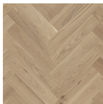
Segno Oak Blonde